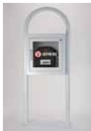
AED Floor Stand Cabinet with Alarm