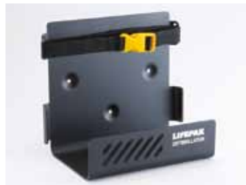
Wall Mount Bracket for LIFEPAK 1000 or LIFEPAK 500 Defibrillators