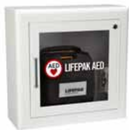
Surface Mount (7" Return)