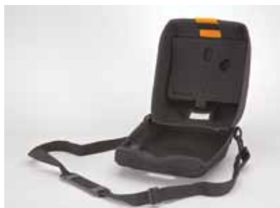
Complete Soft Shell Carrying Case