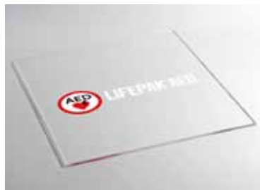
AED Cabinet Window Replacement Kit