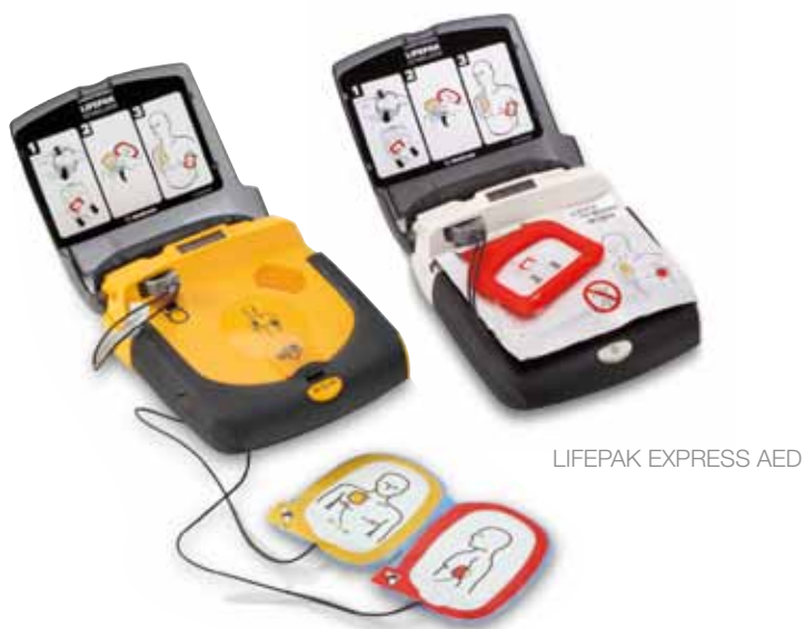
LIFEPAK EXPRESS AED

Ensure the safety of your staff and patients. Only Physio-Control accessories and disposables have been thoroughly tested with LIFEPAK products. Stick with the name you trust and the company that stands behind it. To order, contact your Physio-Control representative or order 24/7 at store.physio-control.com .