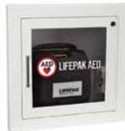
Recessed Mount (1.5" Return)