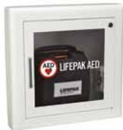
Semi-Recessed (3" Return)