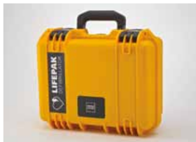
Hard-shell, Water-tight Carrying Case